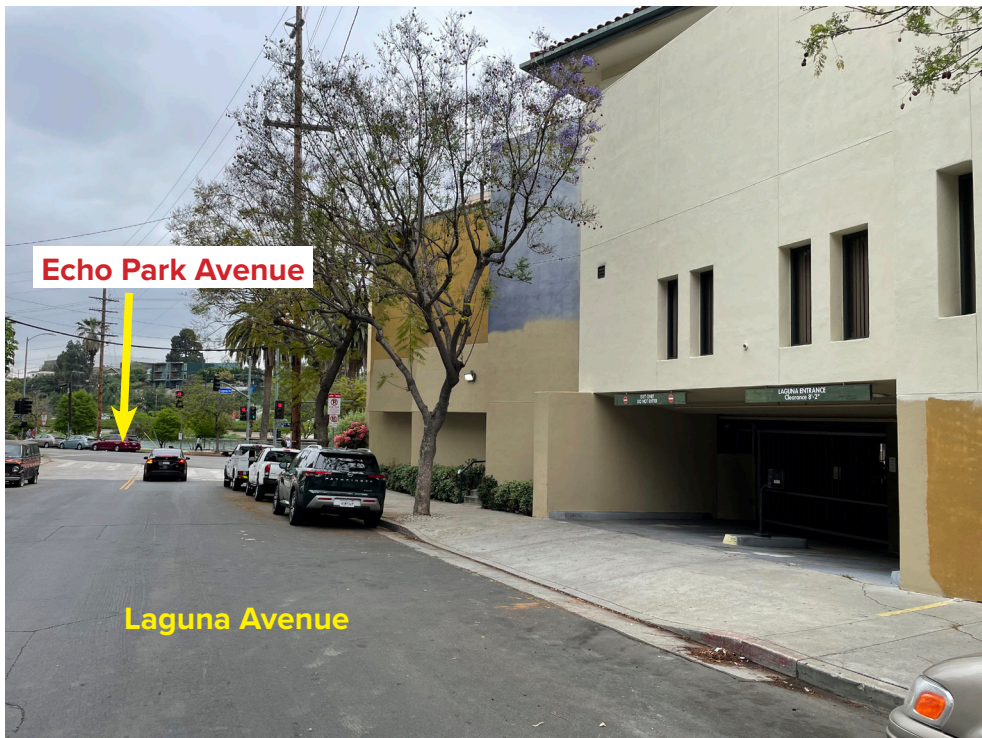
Laguna Avenue looking southwest toward Echo Park Avenue.

We are required to use this entrance; please do not use the Echo Park Avenue entrance!